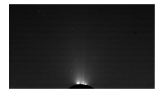
ISS Enceladus image of the surface and the plume